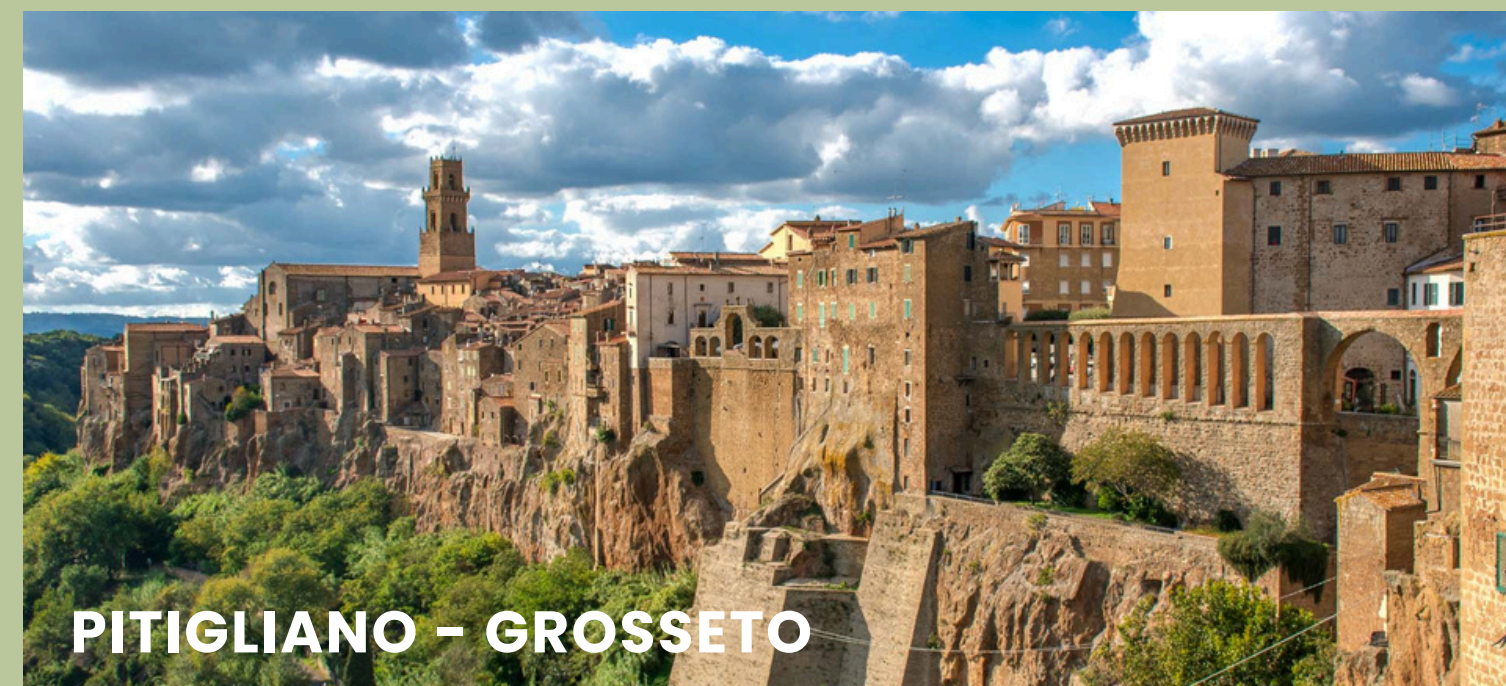
PITIGLIANO – GROSSETO