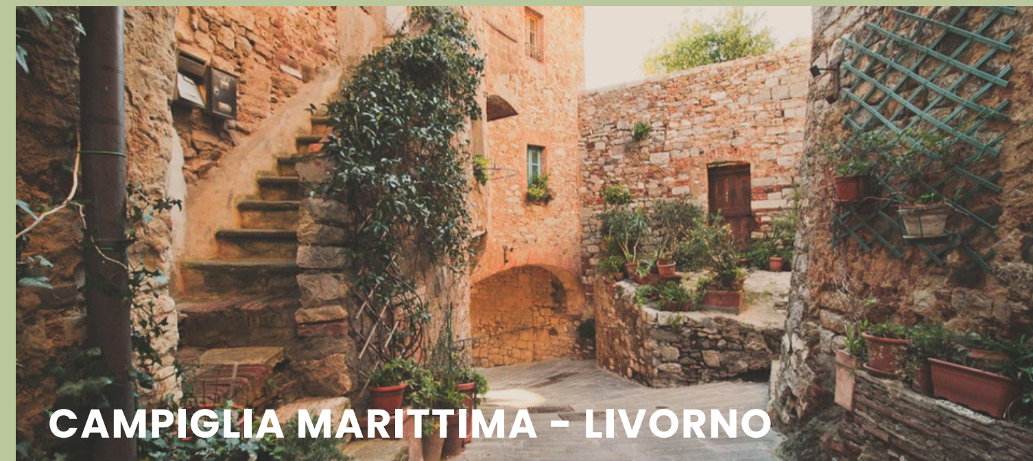
CAMPIGLIA MARITTIMA – LIVORNO