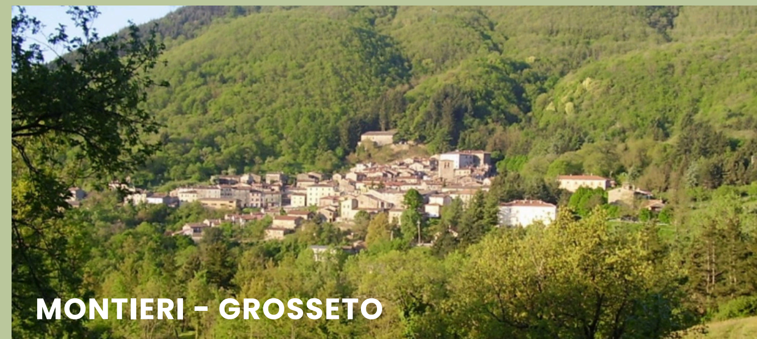
MONTIERI – GROSSETO